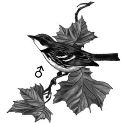
CERULEAN WARBLER Dendroica cerulea

Habitat: Moist, tall mature forests Song: Short, fast, accelerating series of buzzy notes on one pitch, usually ends with single buzzy note. Warblers are common to fairly common migrants to the Arkansas Ozarks, and several are nesting residents for the summer.